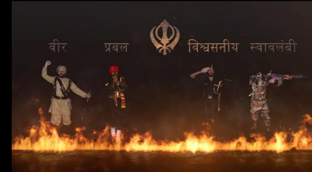
Centenary Movie for Sikh Regimental Centre