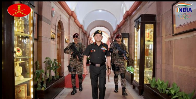
COAS Olympics Message Promo For ADGPI (Strat Comm)