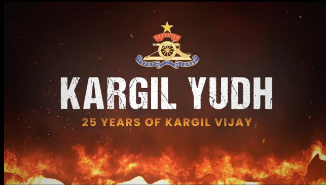
Kargil Movie 2024 for DG Artillery