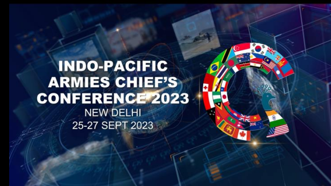
IPACC 2023 Conference Videos