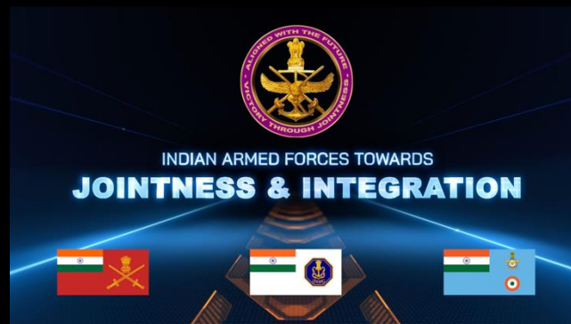
Jointness & Integration Project for HQ IDS (PM Dte)