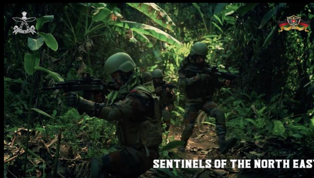
Advertising Promos for PRO Assam Rifles